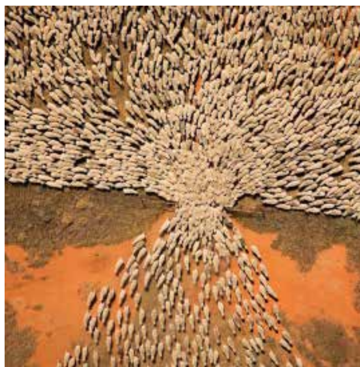
Australian scale sheep farming

Recently the National Sheep Association together with the Farmers Union of Wales (FUW), expressed concern that the Australian trade deal could become another 'Northern Ireland Protocol' situation where a deal is signed only for devastating consequences to be realised later. FUW has called for a break clause to be introduced to allow the UK to withdraw from the agreement should any negative effects become clear. We can only hope that the Government will listen.