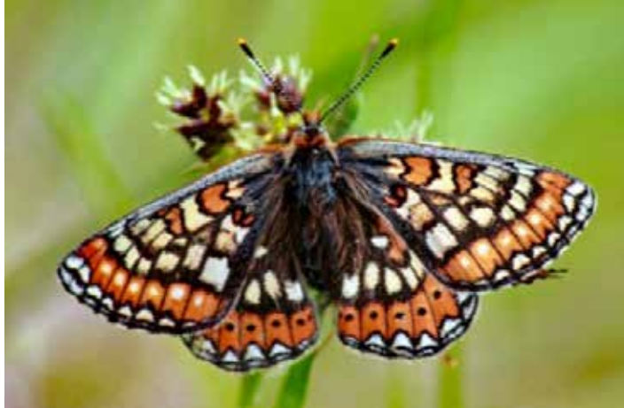
A Marsh Fritillary Butterfly

Cornwall has a very rich and diverse flora and fauna. We have several rare plants and wildlife species. The geology of Cornwall is also interesting and In my travels I have found a few extraordinary and amazing stones, rocks and minerals. Often these have come from Cornwall's most majestic and dramatic coastline.