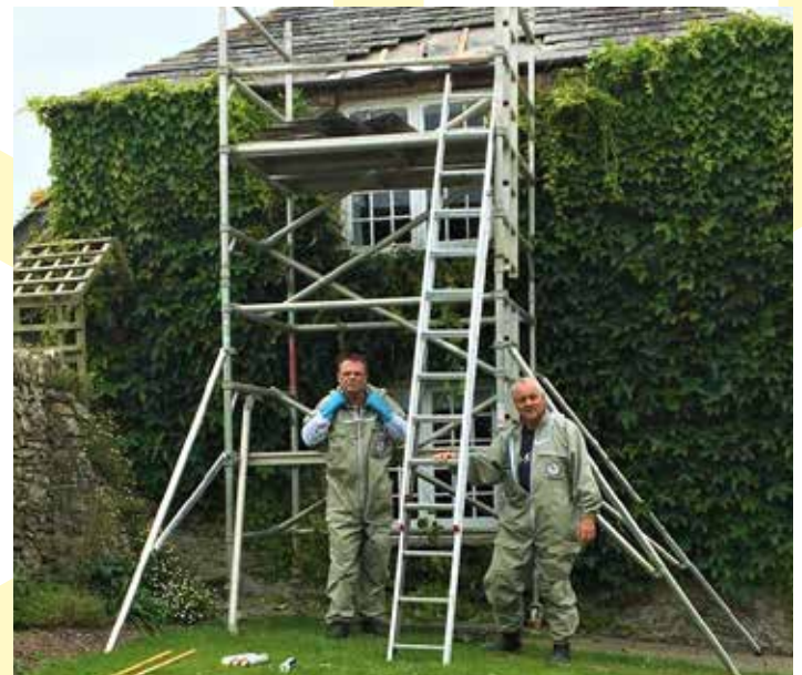
Getting at the bees was not easy

of the British Beekeepers Association, who thought they could help. Also, one of the CPRE Members was happy to make a significant donation to the cost.