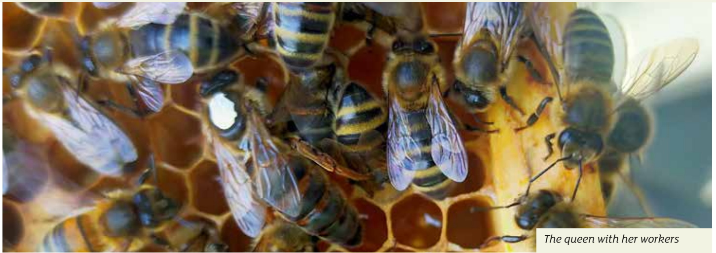
The queen with her workers

I am told that for honey bees to set up home in the roof of a house is unusual. Being high up, for several years I have tolerated them in my cottage, helped by keeping one of the upstairs windows tightly closed! This colony of what was thought to be Cornish black bees was well established and their presence was very evident. The human and bee living accommodation was only separated by a thin layer of plasterboard and a single roof-beam. The colony of thousands of bees occupying this cavity obviously had no immediate plans to vacate their cosy home!